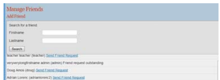
Managing your friends