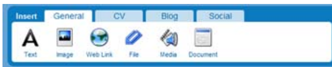
General control panel