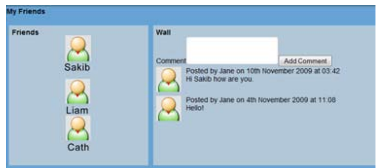
Updating your wall