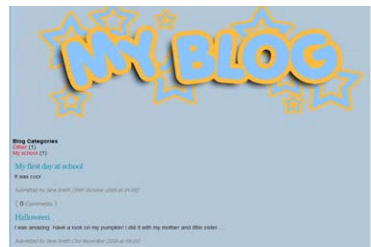
Writing your blog